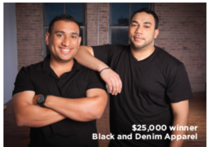
$25,000 winner Black and Denim Apparel

For official rules and entry guidelines, as well as to learn more about MUES winners, visit www.MillerCoorsMUES.com .