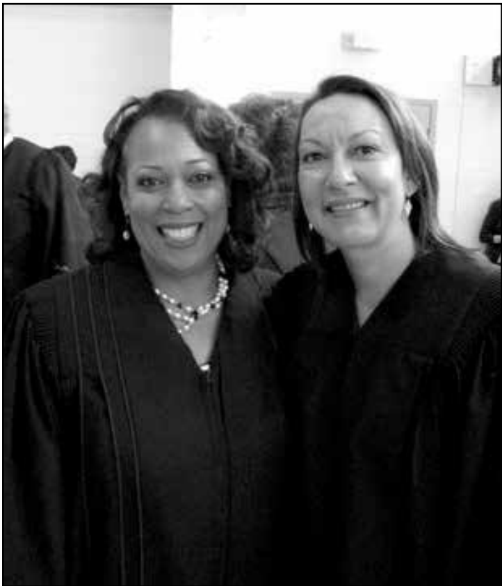
This past Monday, a celebration commemorating the 1991 U.S. Supreme Court victories in Chisom v. Roemer and Clark v. Roemer, put on by the Louisiana Judiciary Council of the National Bar Association. The event had a multiracial audience that included 55 African-American Judges and Civil Rights icons and many others. The celebration was held at the historic New Zion Baptist Church.