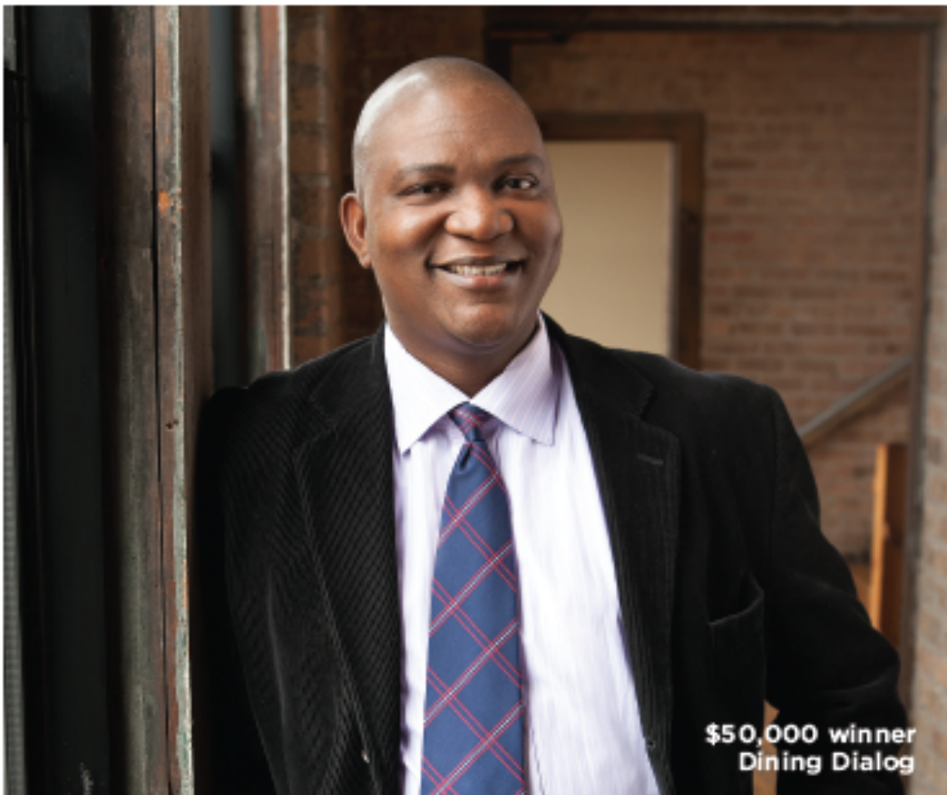
$50,000 winner Dining Dialog

The MillerCoors Urban Entrepreneurs Series is ready to award $150,000 in business grants. Are you ready to compete?