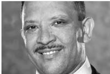
Marc Morial President and CEO National Urban League

"I believe that's Trayvon Martin, that's my baby's voice. Every mother knows their child, and that's his voice." Sybrina Fulton, mother of Trayvon Martin