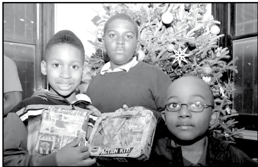
Youth Empowerment Project's (YEP) After-school Enrichment Program participants with their gifts.