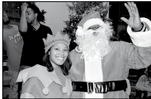
Santa and his helper handed out toys to the YEP participants.