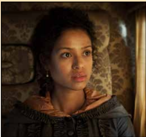
Gugu Mbatha-Raw stars in the historical drama Belle .