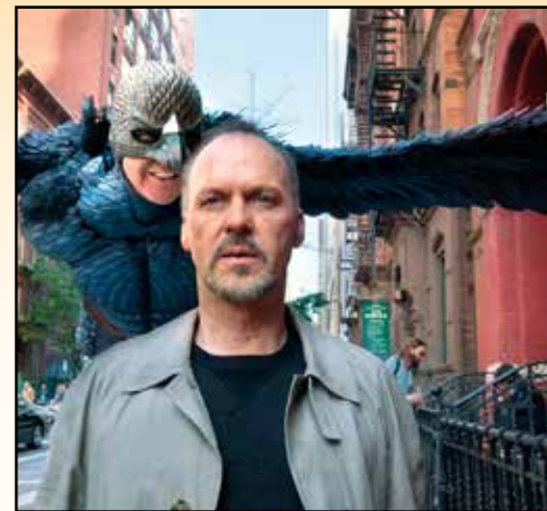
Michael Keaton stars in Birdman .