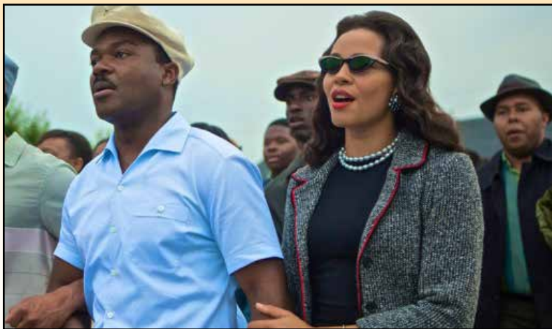
David Oyelowo and Carmen Ejogo co-star in the bio/drama Selma , one of THE BEST FILMS OF 2014.