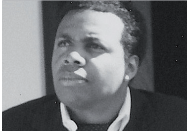
By Edwin Buggage Editor, Data News Weekly

Fifty Shade of Grey, the E.L. James book that went on to sell 100 million copies worldwide and is translated into over 50 languages recently made it to the big screen to mixed reviews. But despite that it was a film that still did well at the box office as many women and couples went to see the film. After talking to many women about the film and the book I wanted to write about it from one male's perspective. I do not in any way claim to speak for other men only myself.