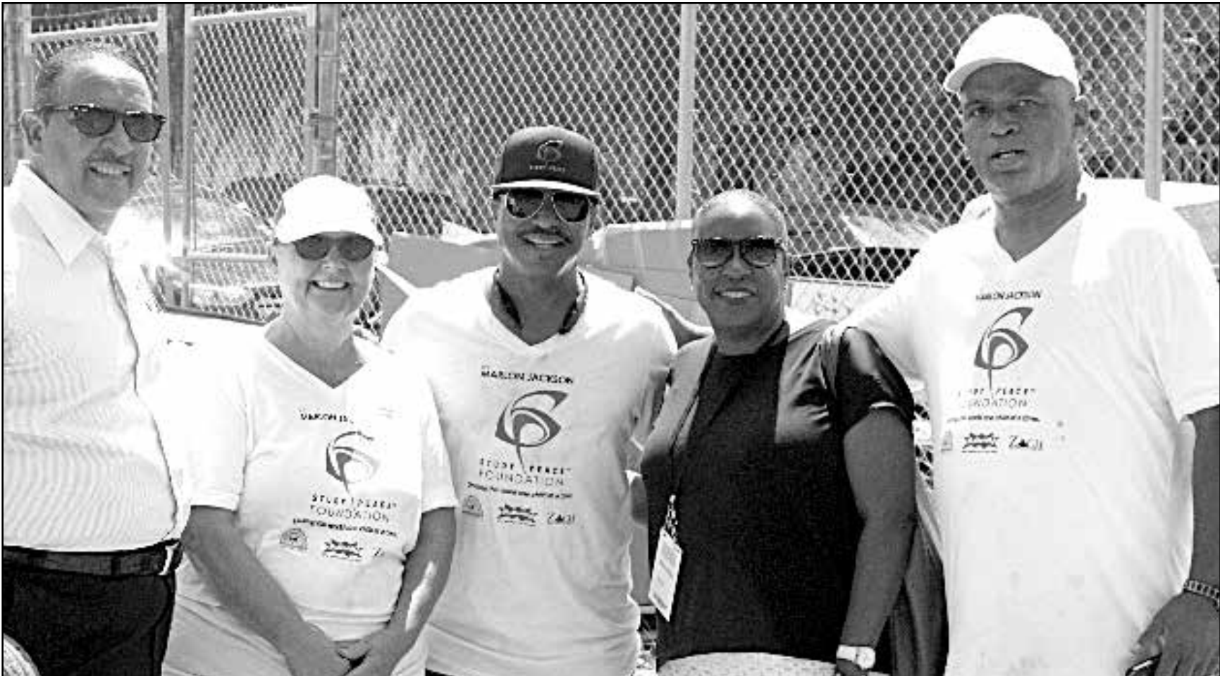
(left) National Urban League President & CEO Marc Morial joins volunteers and Marlon Jackson (center) to build the 7th Ward Marlon D. Jackson/Kaboom Playground on Saturday, August 28th.

Philanthropist Marlon Jackson Brings His Influence to New Orleans