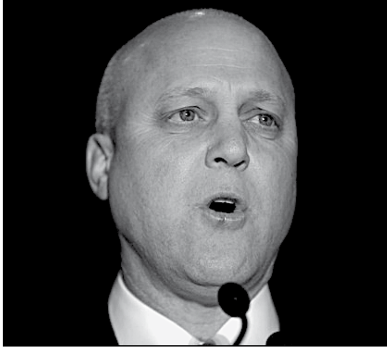
New Orleans Mayor Mitch Landrieu

The judge said he would give Landrieu one week to come up with a reasonable plan to pay the city's firefighters before imposing a sentence. Landrieu and members of the New Orleans City Council were in court when Reese made his ruling. In a press conference, the mayor stated he is extremely disappoint-