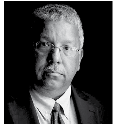
Orleans Parish Civil District Court Judge Kern Reese

"The administration and the City Council have worked diligently to resolve long-standing disputes with some New Orleans firefighters. These disputes involve an outstanding judgment as well as reforming their pension system that was poorly managed and provided irrational benefits. My hope has been that