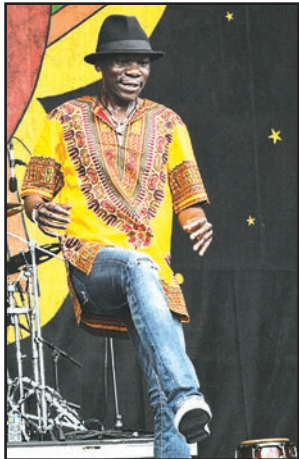
Singer with Mokoomba of Zimbabwe