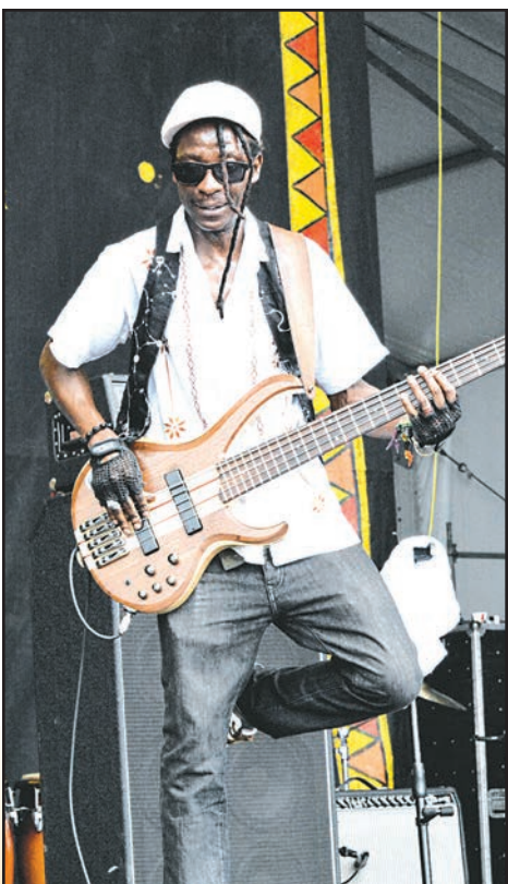
Guitar Player Mokoomba of Zimbabwe