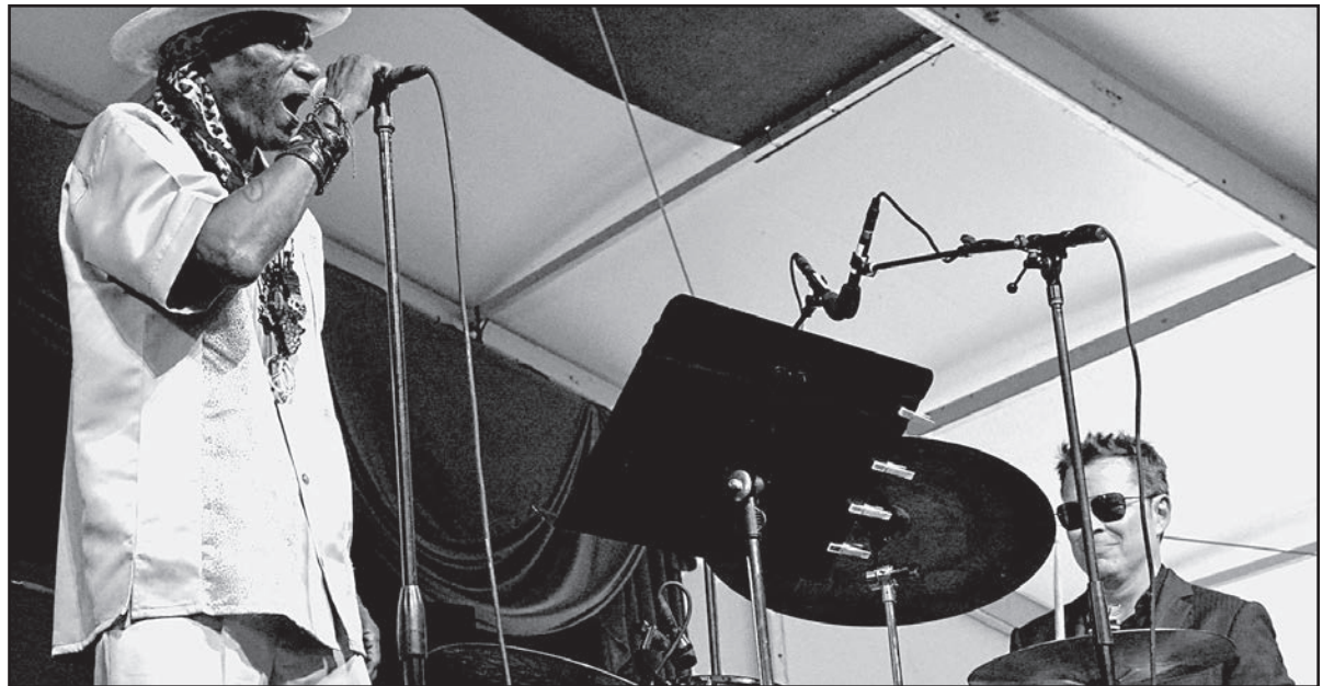
Jazz Fest week two.

acts at the Fair Ground start on Thursday, May 4th, at 11:20 a.m. The final act ends at 7 p.m. on Sunday, May 7th.