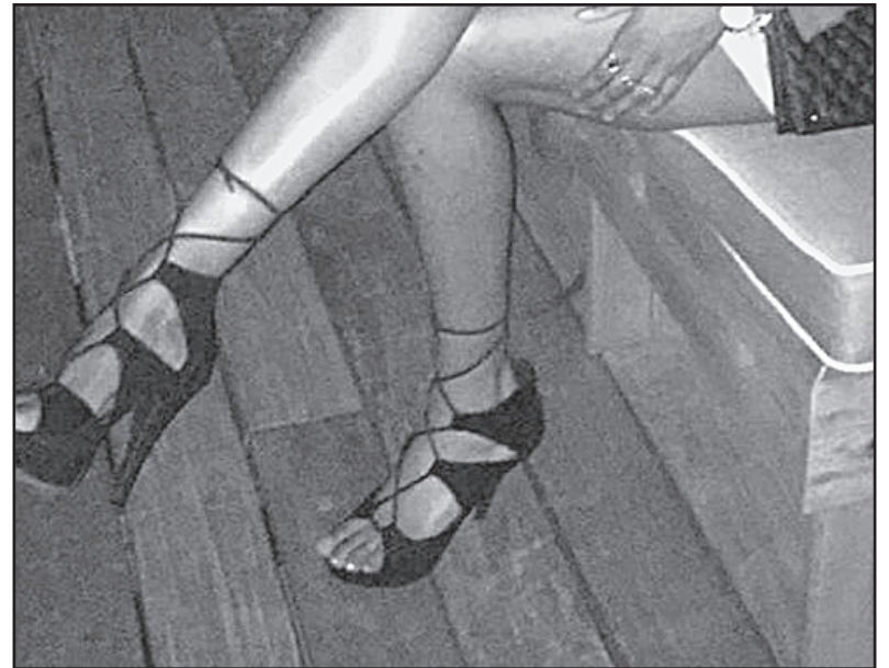
Stiletto heels on model @Delannii on Instagram