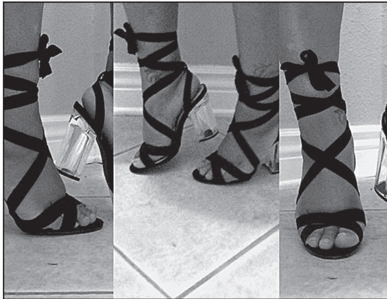
Block heels by @Egypttrendz on Instagram

Wedges are always a great option for beginners in heels. Wedges are made to elevate the foot just like a heel, without the balance commitment. Wedges come in a large variation of sizes and wedge textures such as yarn or plastic based depending on your preference.