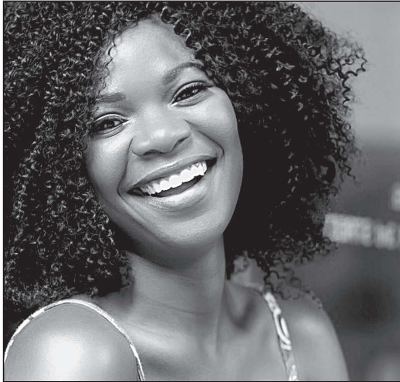
Give your hair ultimate moisture with co-washing.

Wash day can turn into an all-day affair for natural men and women. Depending on your hair length, you might use several bottles of non-sulfate shampoo, conditioners, leave-in conditioners, and gels just to achieve your best wash and go. Using a conditioner instead of a shampoo can be the best option to maintain the health of your curls and here are three reasons why: