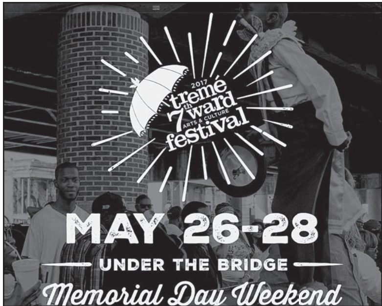
Treme/7th Ward Festival. Image via official festival website.