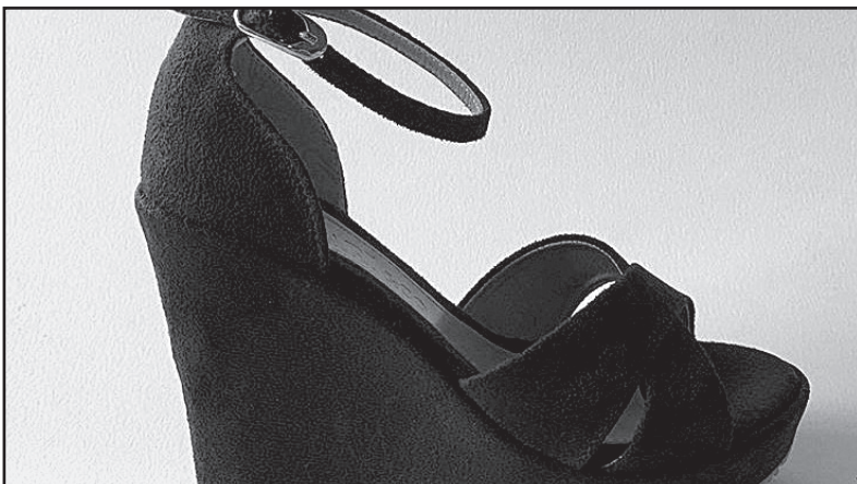
Wedged heels by @Dinari&Co on Instagram