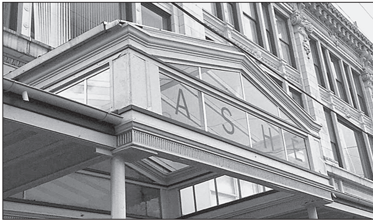
The Ashé Cultural Center is located on 1712 Oretha Castle Haley Boulevard.

It's no mystery that Oretha Castle Haley Boulevard is on the move. In fact, it features a fresh new look and a slew of activities at the many businesses and restaurants up and down the street. A few days ago, Mayor Mitch Landrieu, City