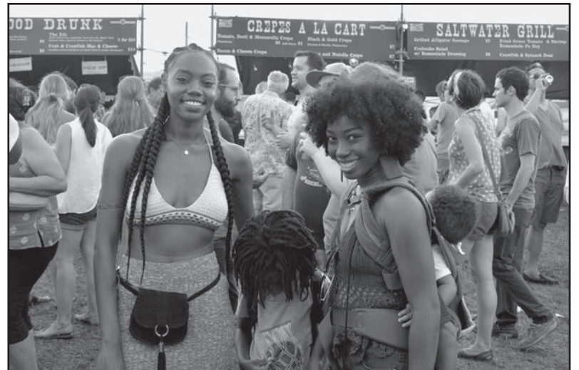
Bayou Boogaloo.

The Crawfish Mambo is hosted by the UNO Alumni Association as