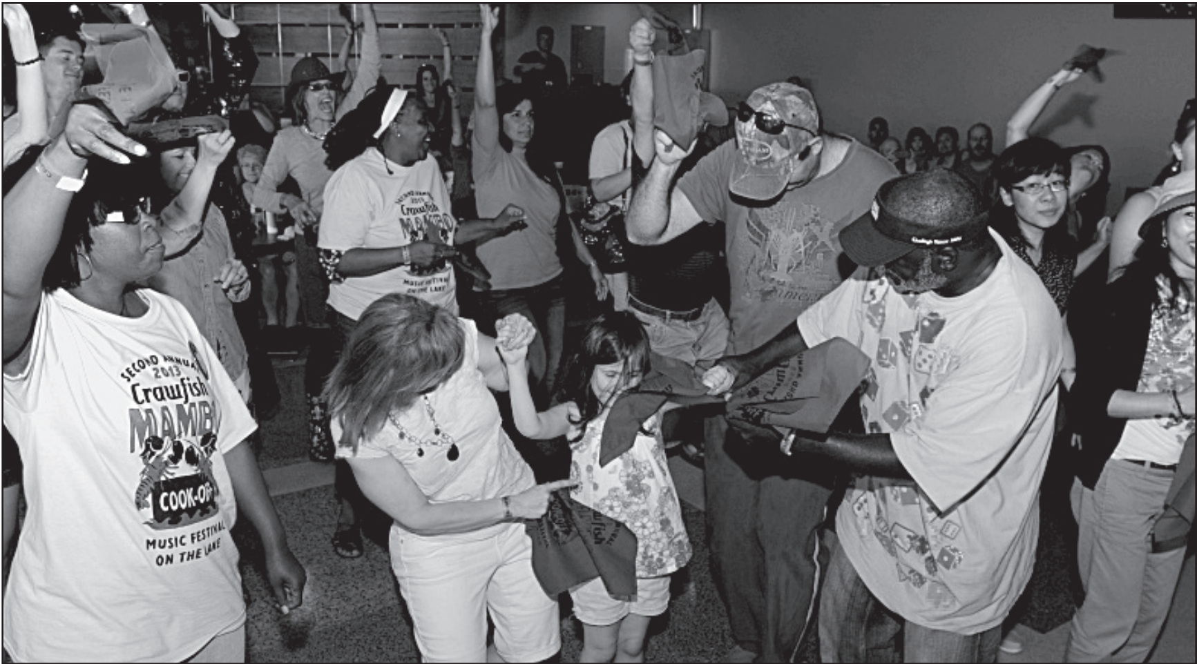
Crawfish Mambo 2017.